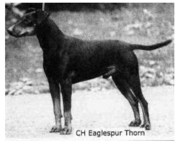
Eng. Ch. Eaglespur Thorn.