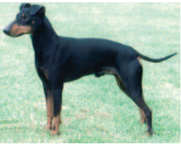
The current breed record holder in the U.K. with 23 CCs, Eng. Ch. Brookstream Beamish.

3. Yes! I think our standard is based on a solid foundation and we should keep it that way. As in many breeds these days, due to good housekeeping, better-quality feeds, etc., some dogs are going over the standard for height. However the standard does say "ideal," and size is not a disqualification, so when judging we do need to maintain a sensible tolerance, but must not change the standard to suit the dog.