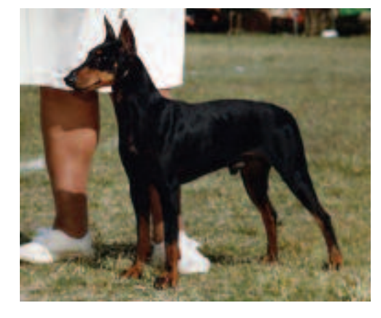
Ch. Salutaire Word To The Wise, the top Standard Manchester sire of all time, bred by the late Myrtle Klensch.